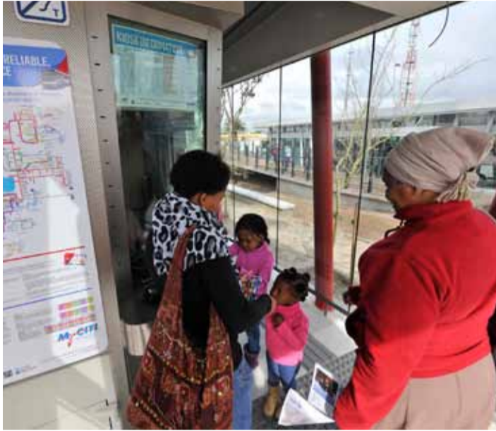
You can load money at MyCiTi station kiosks.

You have two options to load money onto your myconnect card. Load Standard, or load Mover and save.