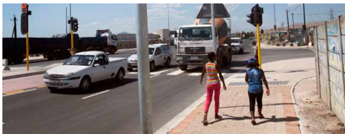
New sidewalks for walking and cycling make it safer for residents.