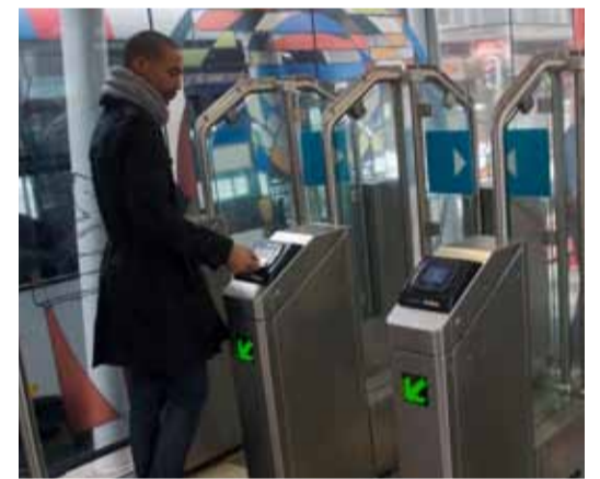
Tap the validator on your right at stations.