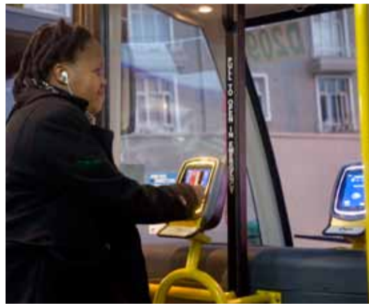
Tap the "IN" validator when you board at a stop.

Tap out by holding your card against the validator as you leave a station or exit a bus at a stop.